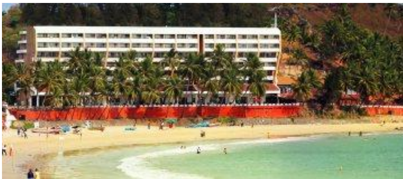
Figure 2: Bogmallo Beach Resort, Bognmalo