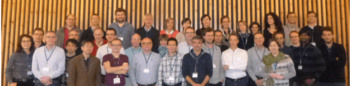
GOV OSEval-TT/GSOP-CLIVAR workshop participants, CLS, Toulouse, France

The Met Office FitzRoy Road, Exeter, EX1 3PB, UK