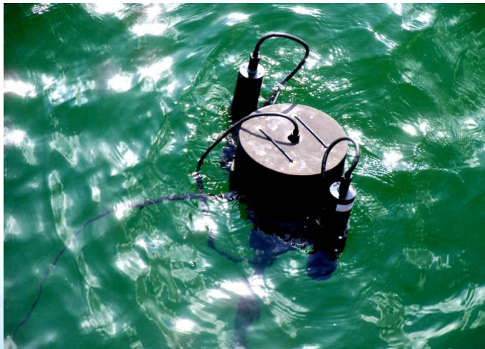
Hyperspectral radiometer deployed during a Noctiluca Scintillans bloom in the northern Arabian Sea.

The occurrence of green Noctiluca scintillans bloom in the Northern Arabian Sea during the winter monsoon is perplexing. Although not known to produce organic toxins, these blooms are still categorized as a harmful due to their association with massive fish mortalities attributed to toxic levels of ammonia. The decay phase of green Noctiluca blooms can result in the decline of dissolved oxygen levels in nearshore subsurface regions, leading to fish mortality and evasion in the region of the blooms. The multi-disciplinary Joint Global Ocean Flux Study (JGOFS) programme in the Arabian Sea had attributed high productivity and export flux to large diatom bloom but had failed to report occurrences of Noctiluca scintillans bloom in this part of the basin.