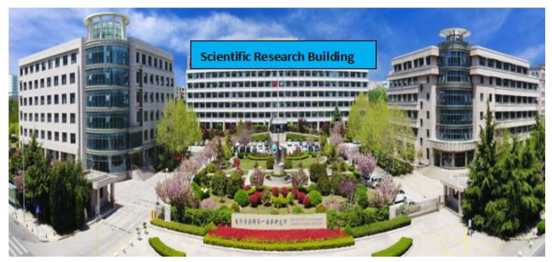
Figure 1: The workshop venue at FIO

The meeting room is on the 8th floor of Scientific Research Building at FIO campus.