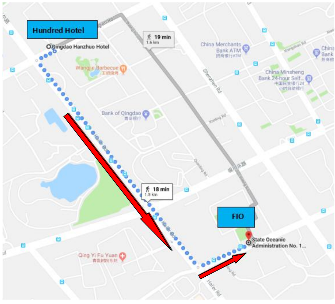
Figure 2: Road map from the Hundred Hotel to FIO